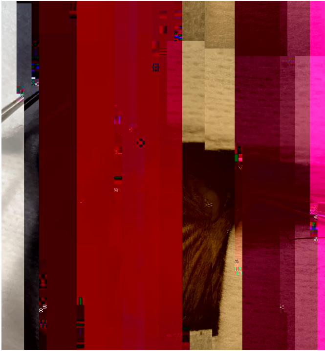
Figure 4 - Incision through muscle wall to expose fat pad, single suture on muscle wall