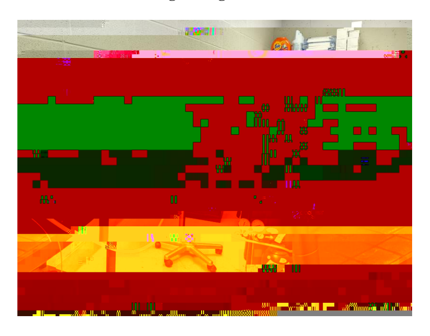
Monitoring equipment running through the MRI bore