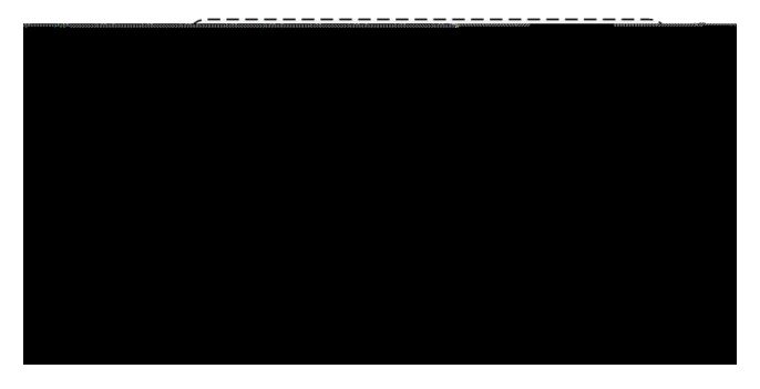
Fig. 2. Block diagram of 622~\mathrm{Mb/s} GPON experimental setup with the BMRx (OSC: oscilloscope).

bandwidth to filter out noise while keeping inter-symbol interference to a minimum [7].